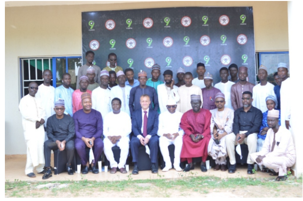
The first set of youths, sponsored by 9mobile to acquire digital and entrepreneurship skills graduated recently during the l st annual Bichi Emirate Lecture on digital initiative in Bichi, Kano State.

The first set of youths sponsored to acquire digital and entrepreneurship skills graduated recently during the 1st annual Bichi Emirate Lecture on digital initiative in Bichi, Kano State.